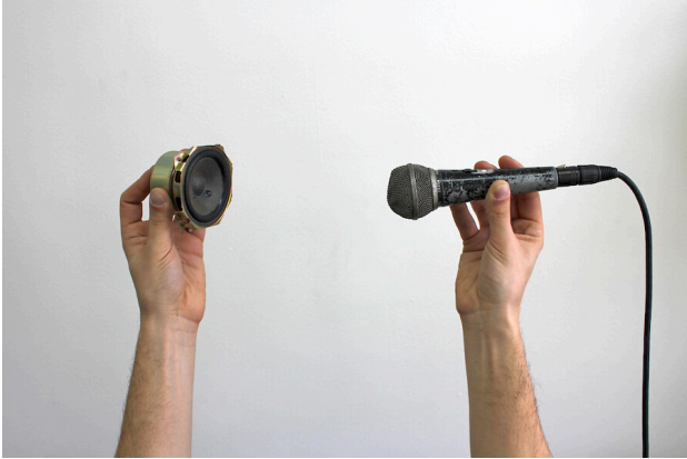
(An image of the sound of empty space. 2015. )