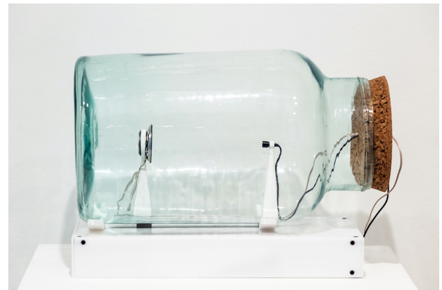
(Vessel. 2015.)