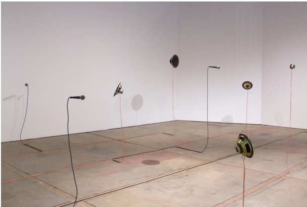
(A Room Listening to Itself. 2015.)