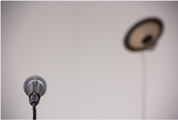
( A Room Listening to Itself . 2015.)