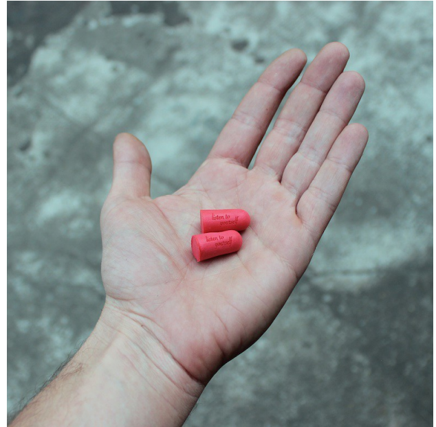
( Plugs (the most important thing is) . 2016.)

be an interface for shared sonic experience. Systems of electronic amplifications are in their essence, systems for communication: a microphone is the ear, a speaker is the mouth.